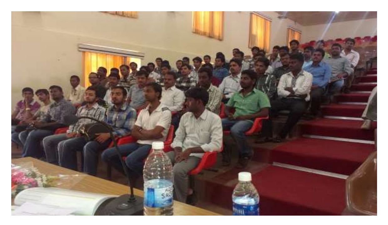
Students present during address